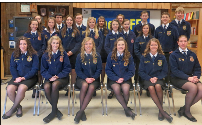
LHS Future Farmers of America