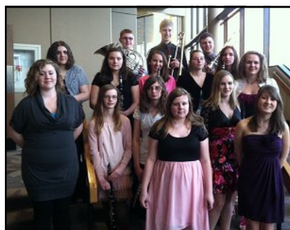
Honor Band & Choir Participants