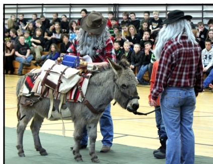
This year's motto: "Go for the Gold!"

Liberty Elementary and Junior High turned in over 300,000 minutes read in the annual read-a-thon using a gold rush theme to promote reading. Students kicked off the event with an all-school assembly with a visit from a gold miner and his burro Shooter and featuring staff members performing a dance routine with hardhats and headlamps.