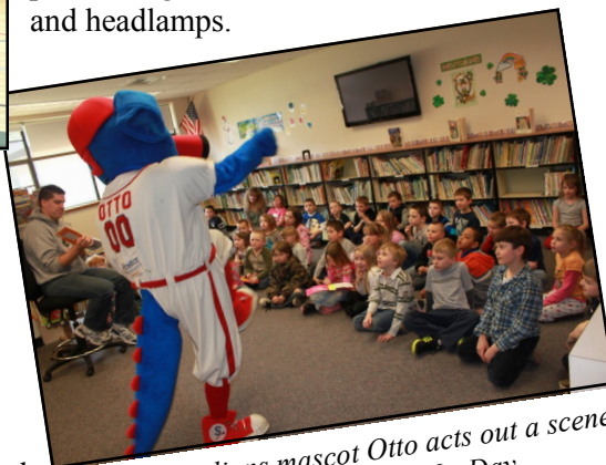
Spokane Indians mascot Otto acts out a scene from a book read by Mr. Day.

All students who read over 600 minutes during the read-a-thon will earn a free pass to Silverwood Theme Park.