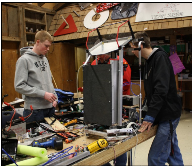
The Mechanics of Mayhem had six weeks to design, build and practice with their robot.

The Mechanics of Mayhem was given the rules of the new game and their kit of parts on January 4. They then had six weeks to design, build and practice with their robot. This year's game is called "Ultimate Ascent." The students must shoot or dump Frisbees into scoring goals on the end of the tennis-court-sized playing field. Their robot must also climb a pyramid-shaped tower in the middle of the playing field to score additional points. This year's game presented many challenges in design and troubleshooting, but the students built a working robot that accomplishes all of the tasks set forth in the game.